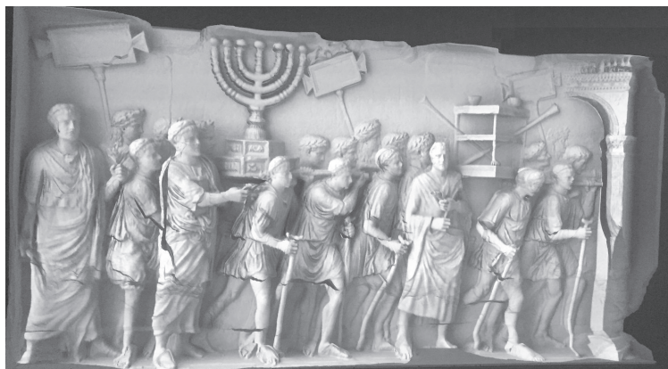
The arch of Titus in Rome commemorates the destruction of Jerusalem in AD70.