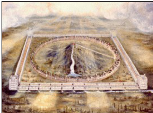
Ezekiel saw a vision of a new temple in Jerusalem. Two temples were later built, but not like the one Ezekiel saw.