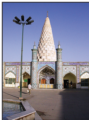
The modern Iranian town of Shush is at the site of ancient Shushan (Susa). It contains this very old building which is believed to be the tomb of Daniel.