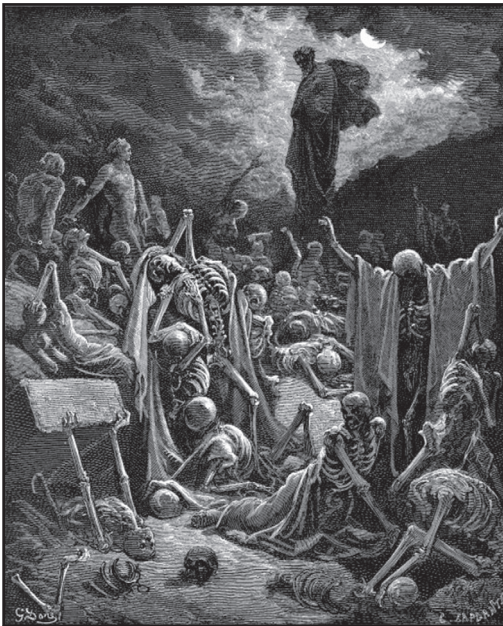
Ezekiel's Vision of the Valley of Dry Bones. An engraving by Gustave Doré.