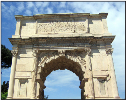
This arch in Rome marks the destruction of Jerusalem by the Romans in 70 AD.