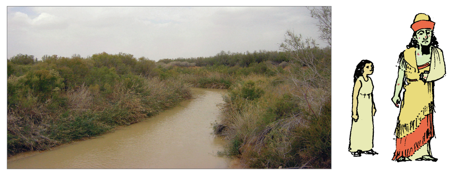
The river Jordan. A bit muddy, do you think?

Can you think of other people who played a big role in an event but whose name we don't know? What does this tell us about their attitude?