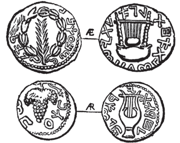
Jewish Lyres. Ancient Jewish coins bearing representations of stringed instruments