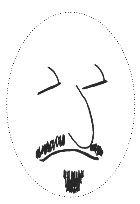
Pharisee with superior look