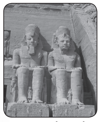
Statues of one of the Pharaohs, called Rameses II