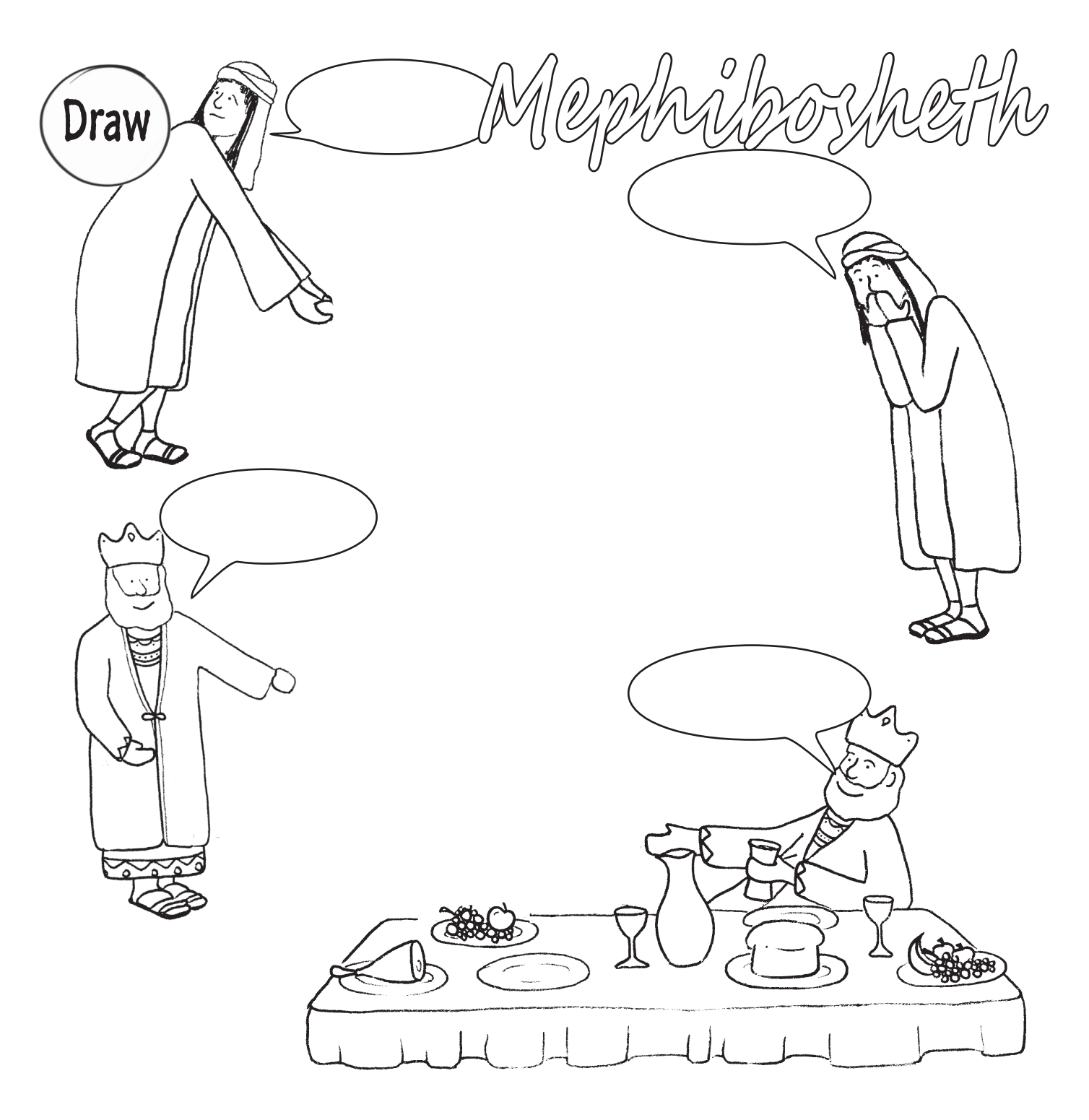
Match the four pictures of Mephibosheth at the bottom of the page with the gaps in the pictures above. There is space to draw them in.