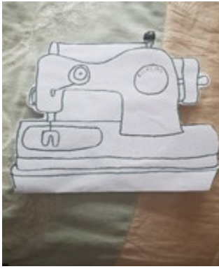
Crafts from lesson on Dorcas: handmade clothes inside a sewing machine!