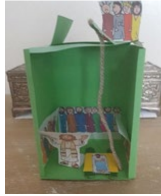
A model of the house where 4 friends delivered the paralysed man to Jesus.