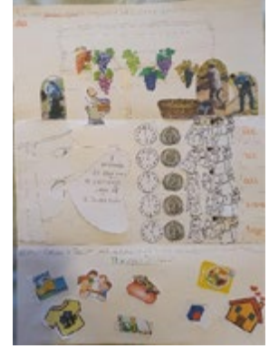
Workers in the vineyard craft