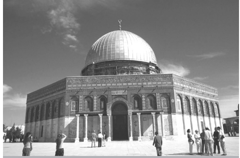
The Dome of the Rock in Jerusalem. Moslems believe that it was Ishmael whom Abraham was asked to sacrifice, probably on the rock inside. The Bible tells us that it was Isaac.

Mohammed is said to have kept kuttah (writers) with him so that whenever a revelation was made it would be written down. Mohammed never claimed to have written the Qur'an. Mohammed died in Medina in Saudi Arabia in 632 AD, and his grave is there.