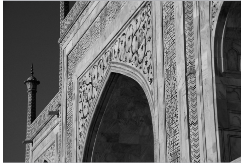
Like many Islamic buildings, the Taj Mahal in India is decorated with verses from the Qur'an