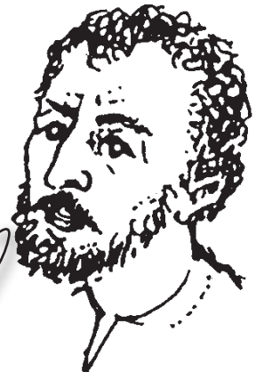
Thomas John 20:19-29