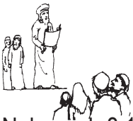
Nehemiah 8:1-9, 18

Look up the passages and summarise the ways in which they celebrated the completion of the walls.