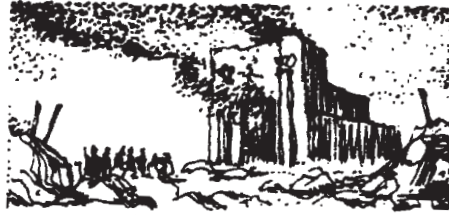
The scene this morning in the Temple area