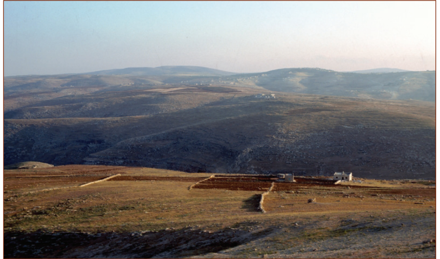
Above: map showing the location of Tekoa. Right: the wilderness of Tekoa.