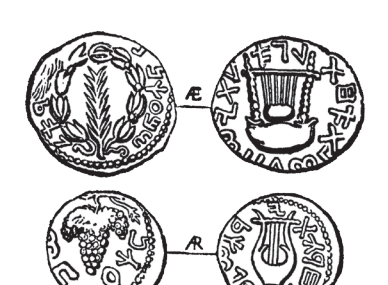
Jewish Lyres. Ancient Jewish coins bearing representations of stringed instruments