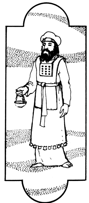
The High Priest

Find out from the references in the grid on the next page what the high priest would see as he went from outside the court through into the most holy place on the day of atonement each year. The letters correspond to the marks on the plan of the tabernacle. What do you think each item teaches us about the way to God?