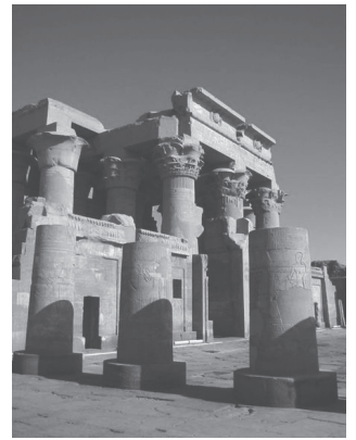
The Temple of Kom Ombo in Egypt, dedicated to the crocodile god Sobek, god of fertility.

Think about 2 Corinthians 6:15-18. How do those words affect us?