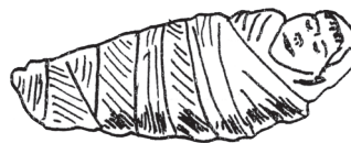
Matthew 1 v 20-23

A virgin will give birth to a son and call his name Immanuel. Isaiah 7 v 14