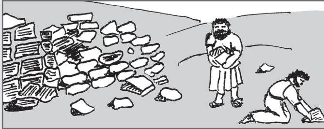
They ..... people. Ezra 5 v 2