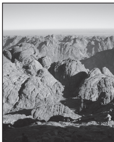
The land around Mount Sinai is very barren. It's not surprising that there was no food or water for the people